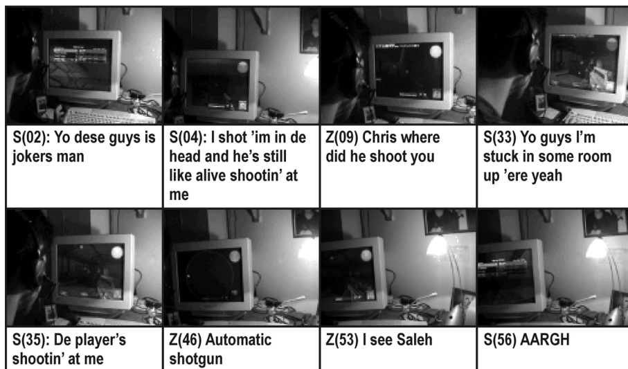
Figure 3: Playing Soldiers of Fortune with Roger Wilco

FFIPS predicts that the form of a communications resource will affect language functions, identity, presence (as defined in the framework), and social protocols. All these influences are shown in the following excerpt from a talk-based session (Figure 3), which lasts around 45 seconds. The pictures show Saleh, whose utterances are prefixed 'S'. The only other speaker is Zak ('Z'), although Chris is online. The numbers represent the time, in seconds (starting from zero) where the utterance commenced.