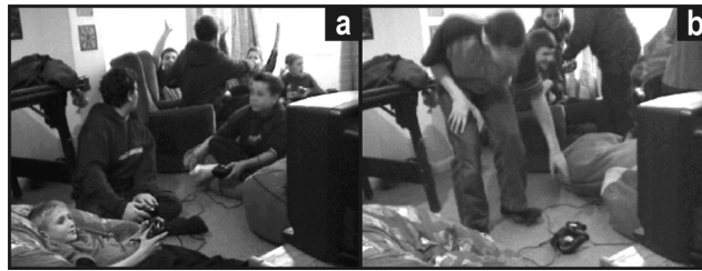
Figure 2: Halo Players: (a) whooping/handslapping; (b) reorganising

you are so SICK'; (2) 'crowing': celebrating one's own achievements, those of another, or their misfortunes e.g. 'Ha ha you're DEAD!'; 'NICE kill!'; (3) strategy talk: e.g. 'I need a gunner'; and (4) side- or self-talk e.g. 'Oh that was SO rubbish...'. The verbal behaviour we saw was associated with a lot of laughter and physical movement (leaning forward, leaning back, shifting, 'punching' the console). We also saw other events which were non-verbal, but afforded by co-location - like the simultaneous arm-raising and cheering by the winning team shown in Figure 1(a); and the rapid reorganisation shown in Figure 1(b).